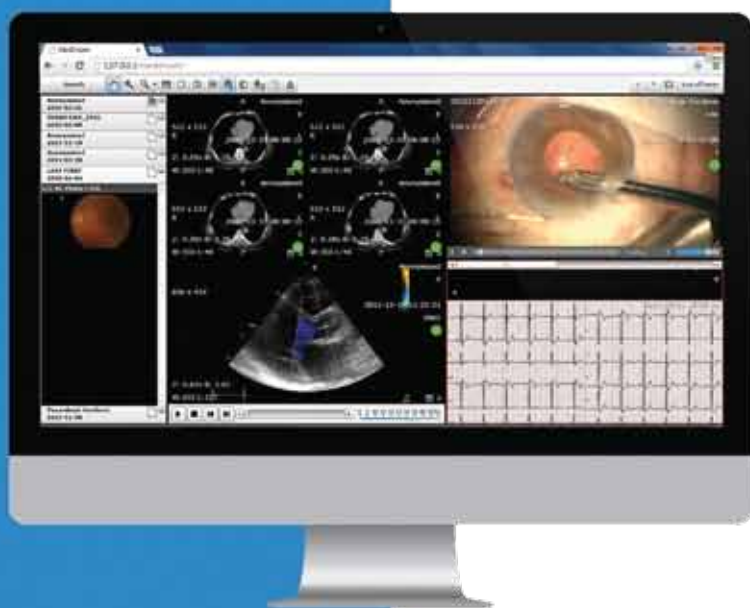
iMAGE Portal seamlessly integrates with Perennity DICOM, our other powerful software solution to manage Disc robots to output patient discs and/or USB drives. You will have the ability of publishing images to optical media (CD/DVD/BD), USB, iMAGE Portal or all.

iMAGE Portal can be used in the local network (LAN) to provide internal site access to clinicians inside your own networked facility. iMAGE Portal can also be accessible from the outside, providing fast access to patients, physicians, radiologists, and all other authorized users. Additionally, you are able to host the iMAGE portal in the cloud, using any Internet service provider.